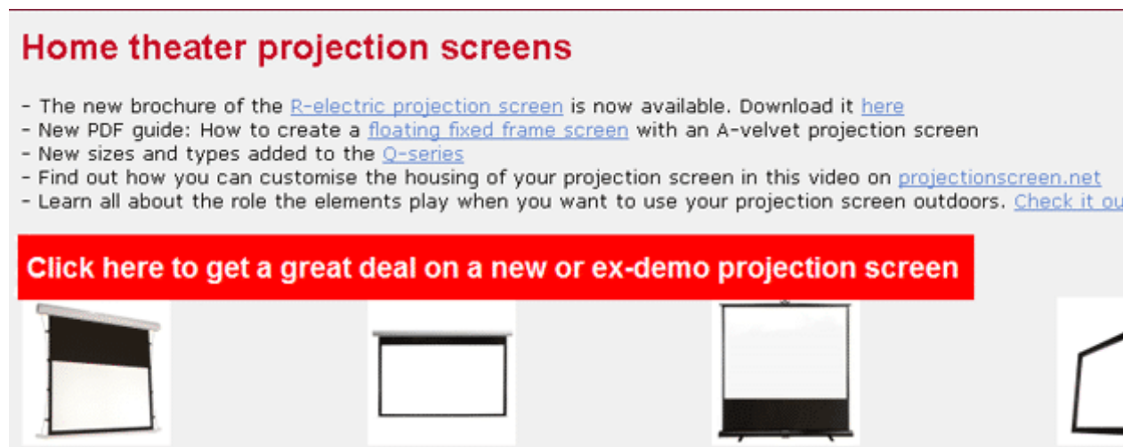
Variation 2 - Page with the Red Banner

So, any guesses on which version got maximum clicks: the blue, red, or banner version? The red link and banner both outperformed the blue link and that wasn't a surprise. But the eye-opening result was the red link winning from the banner.